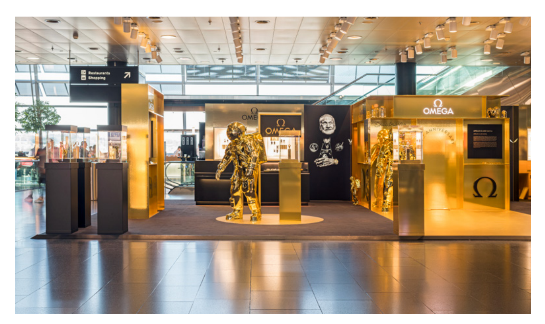
Omega – an eye-catcher in an area spanning 120 m<sup>2</sup>.