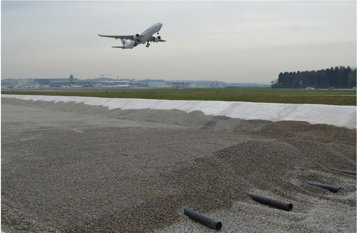
Retention filter basin north of runway 10/28 under construction.