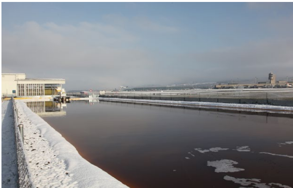
Collection basins for heavily contaminated de-icing runoff.

The catchment area of the de-icing equipment covers all the sites regularly used for de-icing, the apron areas and various taxiways. In addition to the piping system, the plant consists of various underground pumping stations, inspection shafts and eleven underground stacking basins for intermediate storage of the de-icing waste water to be treated. The rain areas are arranged along the slopes. 7 retention filter basins (RFB) are used for the fraction with low contamination. The disposal route is controlled by online measurements of the carbon content via the control system.