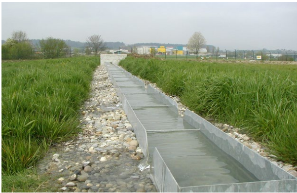
Overflow gutter of a retention filter basin.

During the pilot phase 2000 to 2006, the environmental compliance of the site could be confirmed through an intensive monitoring program of the aspects water, soil, biosphere and air. The pilot phase was accompanied by an expert group with representatives from authorities and universities. During this time, Flughafen Zürich AG set up its own laboratory to monitor water quality in detail. For the operating phase starting in 2007, comprehensive monitoring was reduced and adapted to continuous operation. The focus here is on the early detection of any long-term effects. The most important objectives of the monitoring are the monitoring of discharge limits, the monitoring of soil degradation performance and the documentation of material flows.