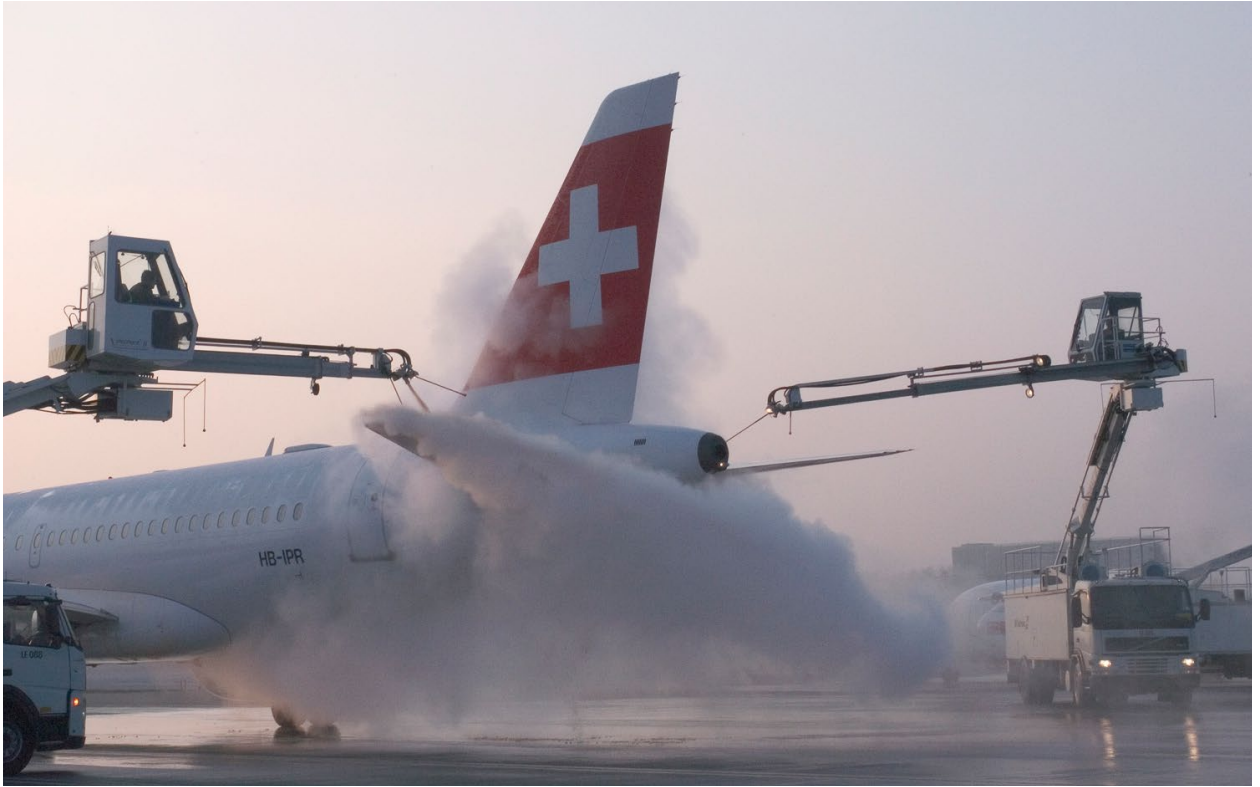
Aircraft de-icing on the de-icing pad.