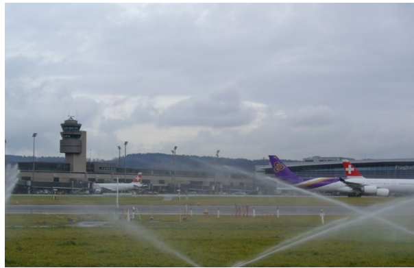
Spray irrigation area directly adjacent to the runway.